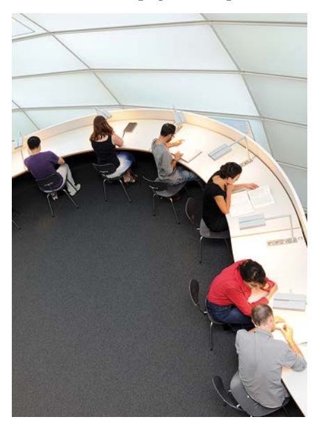
The Philological Library offers excellent study facilities for students and faculty. The library consists of 14 sub-libraries with 750,000 printed volumes.

from the very beginning: the first exchange students went to Stanford University, U.S.A., in 1949. Currently, Freie Universität participates in the programs and Erasmus+ Promos by the Deutscher Akademischer Austauschdienst and also maintains agreements with over 90 universities for direct exchange. Junior researchers are supported in structured Ph.D. programs under the auspices of Dahlem Research School. Many well-known personalities from politics and society studied at Freie Universität, including the