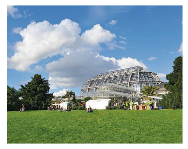
Freie Universität's Botanic Garden is the third largest of its type in the world. It attracts 300,000 scientists and visitors annually